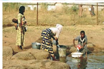
Water project: Gt Missenden