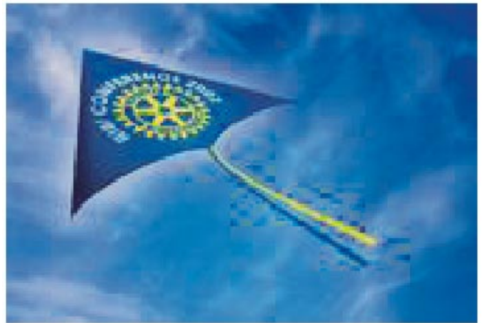
WORLD RECORD KITE FLYING ATTEMPT and Annual Conference of RIBI

A world record for kite flying will be attempted in April at the RIBI conference at the Bournemouth International Centre from 13 th to 15 th April. The kite flying record attempt will be made on Saturday afternoon on the beach front when a thousand school children, local Boy Scouts, Rotaractors, Rotarians and their families will endeavour to fly a thousand kites at the same time. The current entry in the Guinness Book of Records for kite flying is set at 672. The bright blue and yellow kites with the Rotary logo will make a stunning sight, they have been made specially for Rotary by the world's largest kite manufacturer in Weifang in north east China.