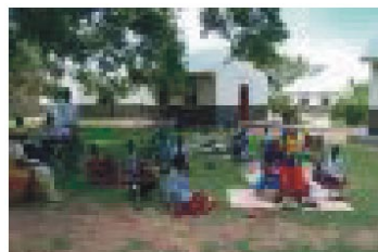
Keno Hospital - Hitchin Priory

In Zambia UNESCO has drilled 600 bore holes which now need pumps! A PlayPump costs US$14000, and PlayPumps are urgently looking for more donors. If any other clubs would like to support this water initiative please contact Frank.