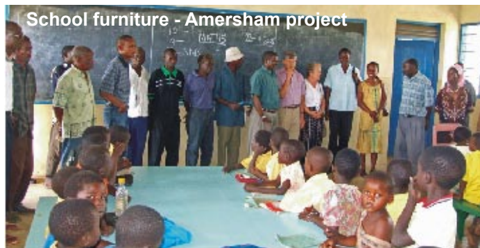
School furniture - Amersham project