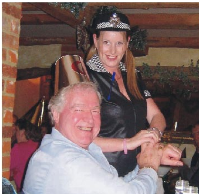
Hello! hello! - Caption required - and there's a bottle of wine on offer for the winner.