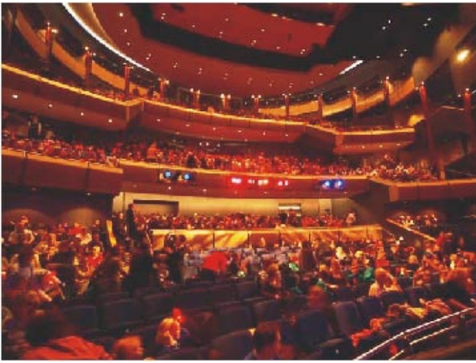
KIDS OUT EXTRA FOR CHRISTMAS

On Thursday 7 th December the Milton Keynes Theatre was packed with 1400 very enthusiastic disabled and disadvantaged children. With sponsorship from HSBC Bank, the theatre welcomed the children and their carers to the final dress rehearsal of this season's pantomime, Cinderella. The children were greeted by bank staff dressed as pantomime characters, and presented with flashing wands and headgear.