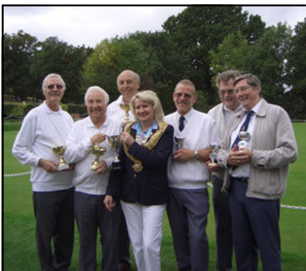
District Bowls Tournament winners Amersham A Team and runners up Luton Chiltern